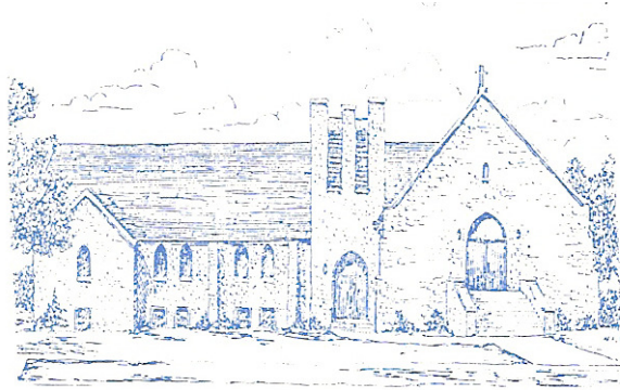
Bryn Mawr Presbyterian Church

The John Knox Presbytery and Bryn Mawr Presbyterian Church